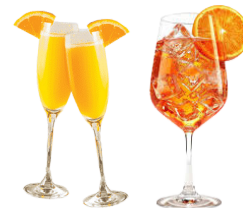
Mimosa | Spritz 9